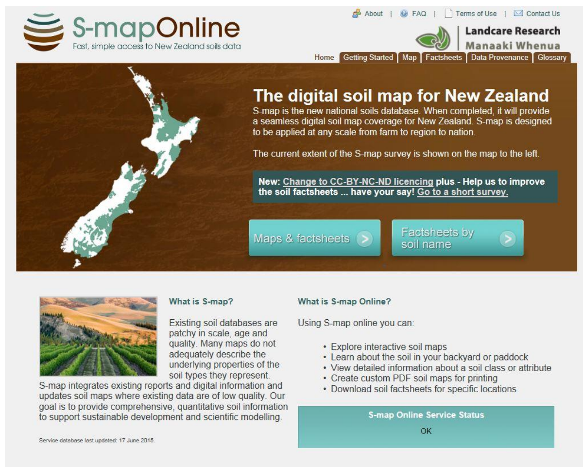
Figure 2 Front page of S-MapOnline showing the link to the soil factsheet survey.

The survey was available online from 9 December 2015 to 12 January 2016.