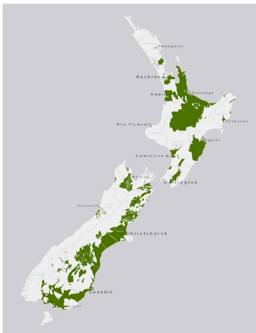
Figure 1 S-Map coverage (green) as at January 2016.

S-Map is working towards a national coverage. Mapping to date has concentrated upon the productive land areas; areas are added as time and funding permit. Figure 1 shows the current coverage.