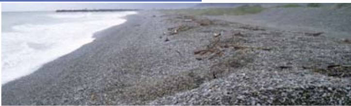
Typical profile characteristics of a gravel beach similar to that in the area, and to the north of Westroads Yard at Blaketown.

The characteristics of the beaches change between Paroa and the Tip Heads. Around Paroa the beach is defined as a mixed sand and gravel beach, and here the intertidal and upper beach has a shallower slope and a convex profile. Occasionally such beaches can have a steeper step, at the point where waves break at high tide.