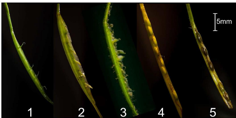
Figure 4. Flowering stages of Zostera marina : 1) styles erect from the spadix 2 , 2) styles bend back after pollination, 3) pollen is released from the anthers 3 , 4) seed maturation, 5) seeds are released.

Seed-based restoration first requires the collection of seeds from donor meadows. Seagrass seeds attached to floating shoots can also disperse (Stafford-Bell et al. 2016), therefore, beach-cast wrack may be a potential source of seeds for restoration. Seagrass flowering and seed production has various stages (e.g., Figure 4), following seasonal patterns controlled by light, temperature and nutrients (Dos Santos & Matheson 2017). An in-depth understanding of sexual reproduction for the target seagrass population is important given the variation that can occur between species and populations (Kendrick et al. 2012; Dos Santos & Matheson 2017). For Z. marina , the collection of flowering shoots with maturing seeds for restoration has traditionally been carried out by hand (e.g., via snorkelling or SCUBA; Busch et al. 2010; Orth & McGlathery 2012). Mechanical harvesting of Z. marina seeds with a barge can be used to improve collection efficiency and still has a low impact on the donor meadow (Marion & Orth 2010). However, collection rates depend on seagrass productivity and it is currently unknown if mechanical harvesting is worthwhile for Australian and New Zealand species (Tan et al. 2020). Once collected, flowering shoots can be suspended above tanks until the seeds are shed, which is followed by processing to separate the seeds from leaf and stem matter (Marion & Orth 2010; Tanner & Parham 2010).