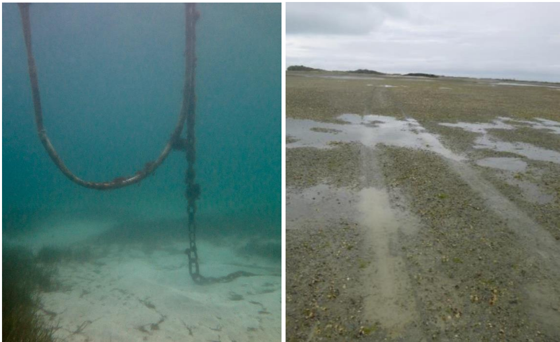
Figure 3. Photographs showing scouring of subtidal seagrass surrounding swing moorings at Slipper Island (left), and vehicle tracks on intertidal seagrass in Wakapuaka/Delaware Inlet (right), Aotearoa New Zealand.