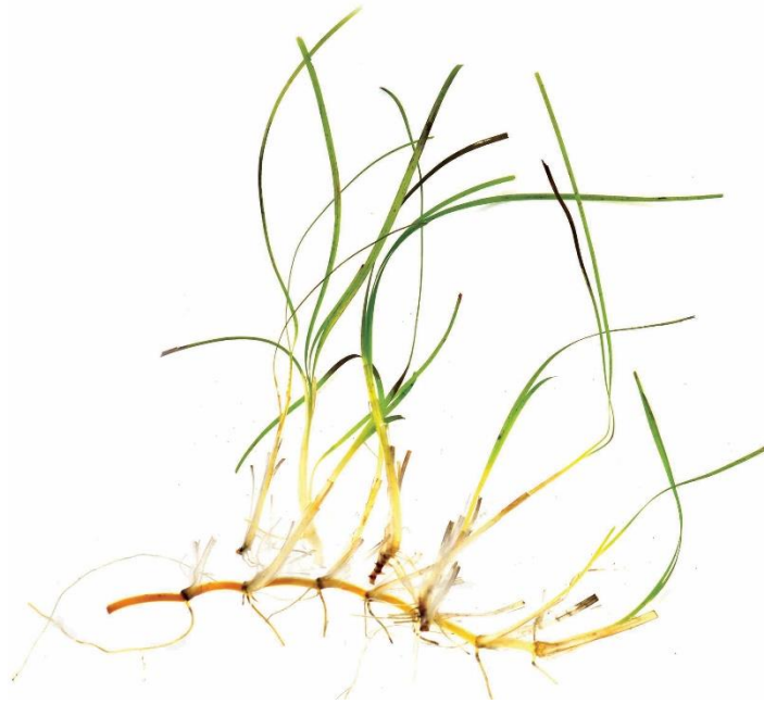
Figure 5. Fragment of Zostera muelleri.

Following collection, fragments can then be propagated in a laboratory or nursery or directly planted at a restoration site. As the survival of stored fragments often decreases over time, fragments planted within a few months of collection may have the greatest success (Balestri et al. 2011). Direct transplantation of fragments has been successful for Z. muelleri . For example, Zhou et al. (2014) reported > 95% survival after three months and no significant differences in shoot density, height or aboveground biomass compared to a wild meadow after three years. However, in a different study 100% of transplanted Z. nigricaulis fragments died within 100 days, possibly because of the timing of the transplantation (Thomson et al. 2015).