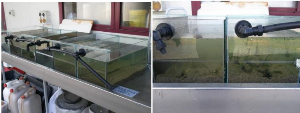
Figure 7. Growing seagrass ( Zostera muelleri ) in a simple nursery system in Aotearoa New Zealand.

Key considerations for nursery establishment include: