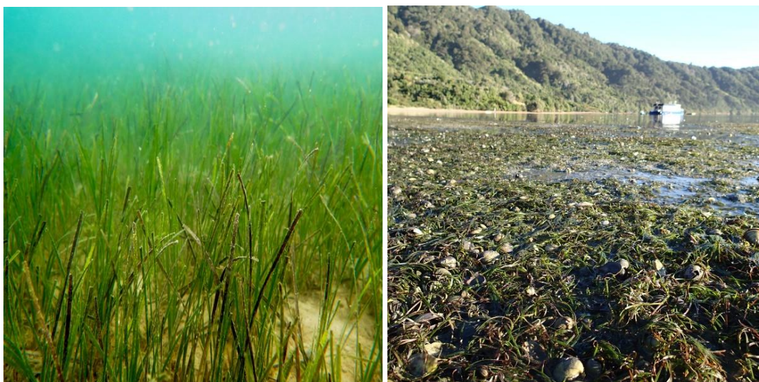
Figure 1. A subtidal seagrass meadow at Great Mercury Island (left) and an intertidal seagrass meadow at Shakespeare Bay (right), Aotearoa New Zealand.

Seagrasses are flowering marine plants that form extensive meadows in both intertidal and shallow subtidal coastal environments. These meadows commonly occur in sheltered, soft-sediment areas, away from strong currents and wave action (e.g., estuaries; Hemminga & Duarte 2000; Spalding et al. 2003). Aotearoa New Zealand has only one species of seagrass, Zostera muelleri 1 (Figure 1). It colonises intertidal areas and grows subtidally where water clarity permits (Turner & Schwarz 2006).