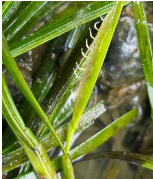
Figure 9. Seagrass flowering in Zostera muelleri showing protruding stigma 10 to catch pollen for fertilisation (Photo: Tracey Burton, from de Kock et al. 2016).

Seed-based restoration (refer Section 2.2) has not been trialled in Aotearoa New Zealand because it was previously thought that sexual reproduction for Z. muelleri occurred infrequently (Turner & Schwarz 2006). For example, extensive sampling within Raglan Harbour found no evidence of a sediment seed bank (Cade 2016). However, recent research has documented flowering by Z. muelleri (Figure 9) in several locations across the country, indicating that seed-based methods may be an option for restoration if viable seeds can be found.