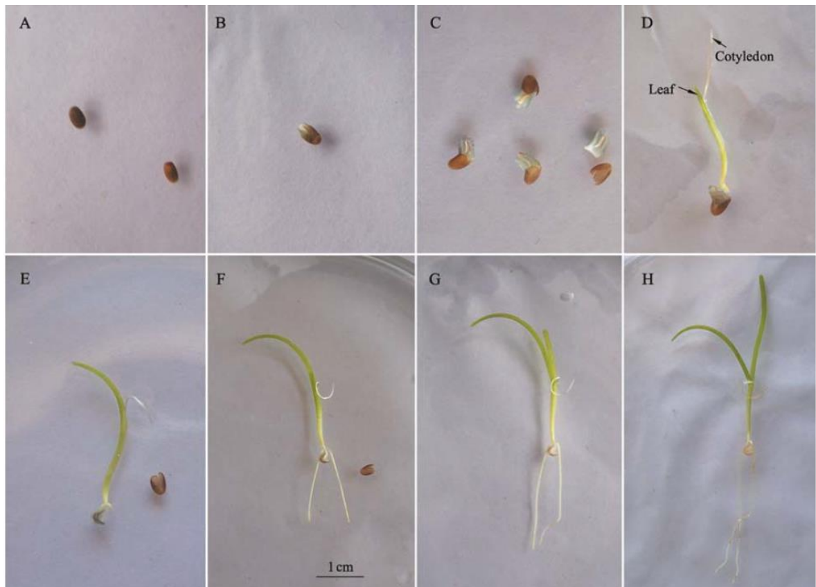
Figure 6. The morphology of Zostera marina seedlings. A, seed; B, after 1 d; C, after 2 d; D, after 1 week (arrows show cotyledon 8 and leaf); E, after 2 weeks; F, after 3 weeks; G, after 4 weeks; and H, after 5 weeks. (Photos: Pan et al. 2011).

On smaller scales, seed germination and seedling growth and survival in cultured conditions has been demonstrated in experimental trials for several Zostera species (Abe et al. 2009; Tanner & Parham 2010; Kishima et al. 2011; Pan et al. 2011; Wang et al. 2016; Xu et al. 2016; Cumming et al. 2017). Germination was found to be influenced by several environmental variables including salinity, temperature, dissolved oxygen, sediment type, and seed burial depth (Moore et al. 1993; Orth et al. 2000; Abe et al. 2010; Kishima et al. 2011; Wang et al. 2016; Cumming et al. 2017). Survival and growth of cultured seedlings was also influenced by temperature and salinity, as well as light and sediment nutrient enrichment (Abe et al. 2010; Xu et al. 2016).