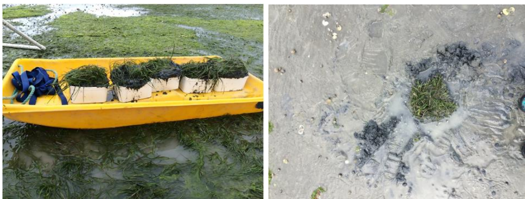
Figure 8. Intact sods being transported (left) and in-situ at the restoration site (right) in the Avon-Heathcote seagrass transplant experiment.

Extensive loss of seagrass occurred in Ihutai/Avon Heathcote estuary prior to 1929 with almost no seagrass remaining by 1952 (Inglis 2003). Since then, the extent of seagrass bed has fluctuated and was reported to cover 52 km 2 in 2016 (Gibson & Marsden 2016). A transplant experiment was carried out in the estuary in 2016, using intact sods harvested from two donor sites (Figure 8; Gibson & Marsden 2016). However, after three months only four of the 15 transplanted sods were still alive. The rest had either washed away, been smothered with sea lettuce ( Ulva spp.) or died after bleaching. Gibson and Marsden (2016) recommended that seagrass transplantation is undertaken in the spring when seagrass growth has resumed.