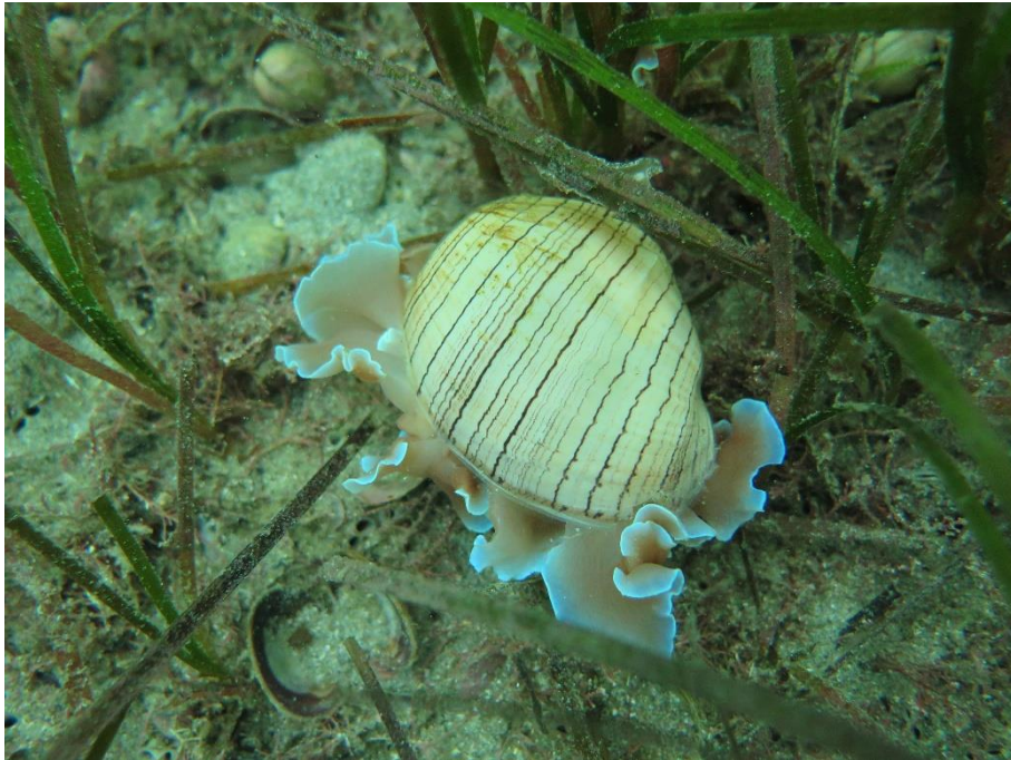
Figure 2. Bubble shell hiding within a seagrass meadow at Slipper Island, Aotearoa New Zealand (Photo: Dana Clark, Cawthron Institute).

carbon-rich sediments from adjacent habitats. By stabilising sediments and taking up nutrients and contaminants (e.g., metals; Birch et al. 2018) from the water as they grow, seagrasses also act as natural filters, thereby improving or maintaining coastal water quality (Short & Short 1984).